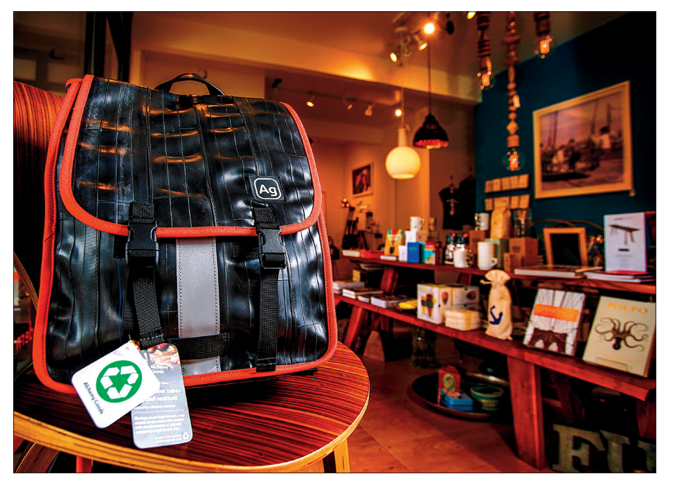
At Zinc Art + Object in Edmonds, a backpack made with used bicycle tires offers a sturdy, messenger bag with the bonus of coming from recycled materials.